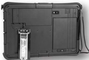
User Removable SSD